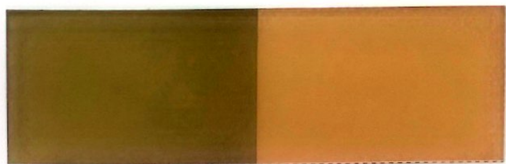
AG6325PCST/AG6325PCWR 10-30 Solar Gold Satin