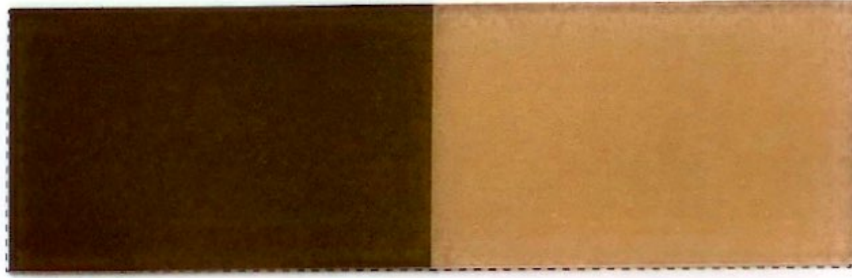
AG6305PCST/AG6305PCWR 10-60 Solar Gold