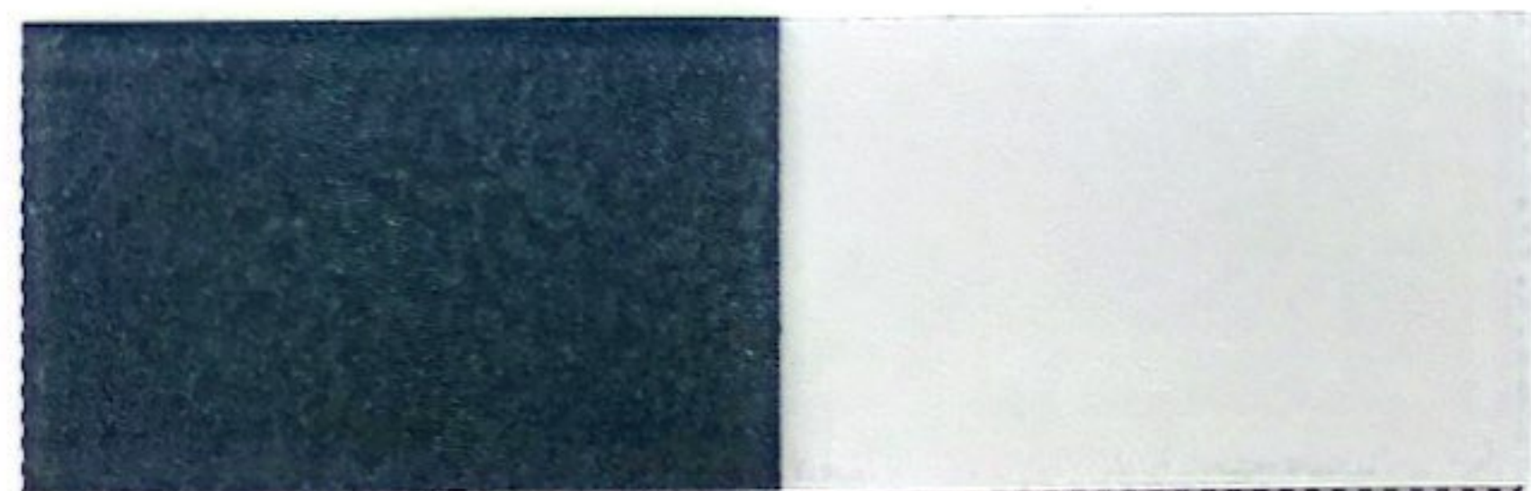
AG153PCST/AG153PCWR 10-125 Flashing Silver