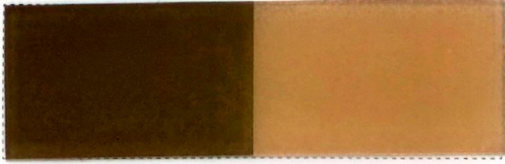
AG6351PCST/AG6351PCWR 10-100 Shimmer Gold