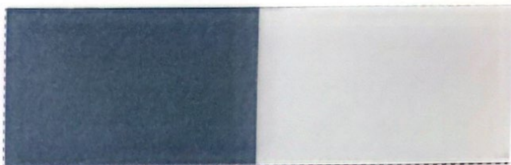
AG100PCST/AG100PCWR 10-60 Silver Pearl