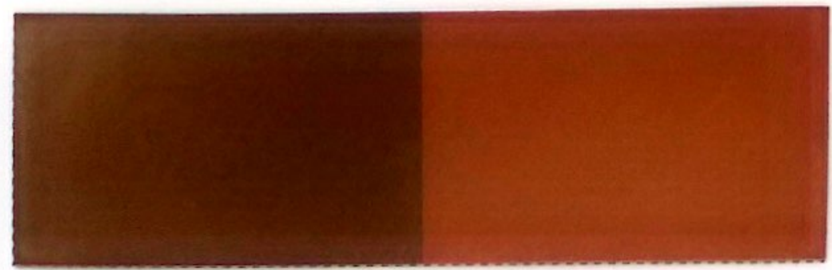
AG6531PCST/AG6531PCWR 10-60 Super Bronze