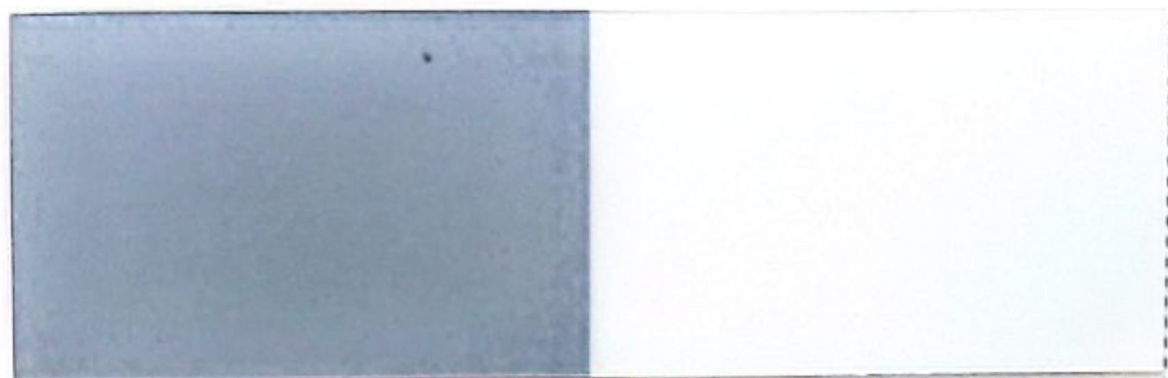
AG120PCST/AG120PCWR 5-25 Shiny Satin