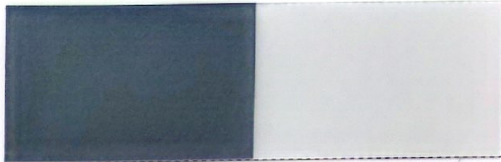
AG6126PCST/AG6126PCWR 5-25 Pure white Silk