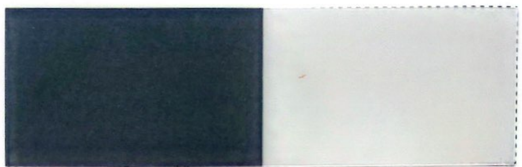
AG6136PCST/AG6136PCWR 10-60 Pure Silk Silver