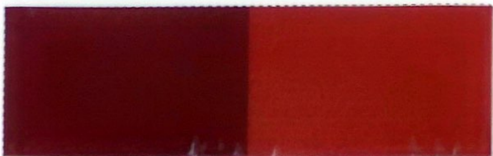
AG9504WR 10-40 Wine Red