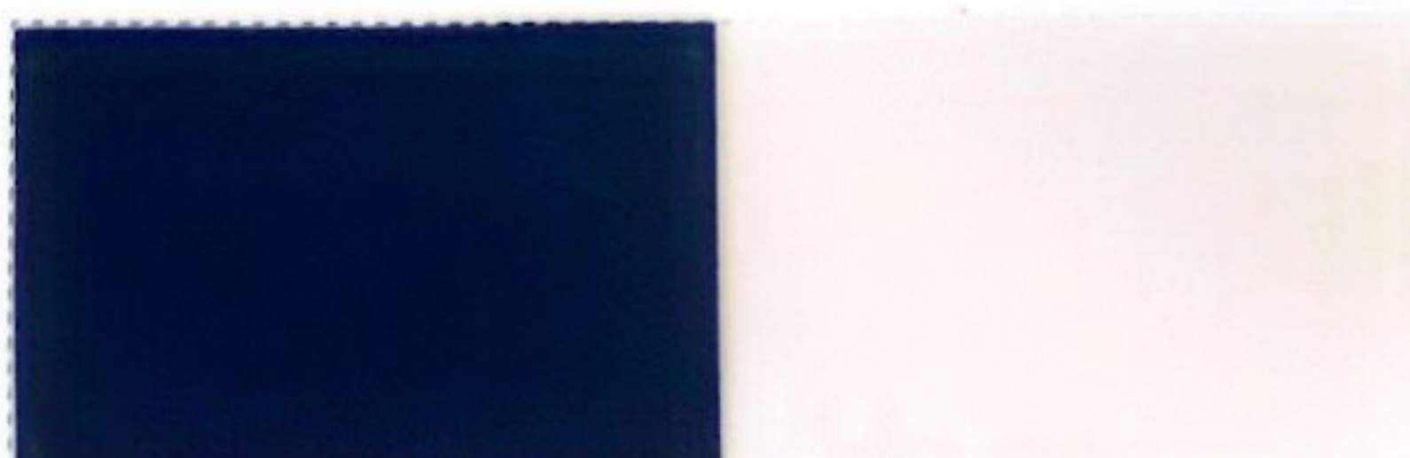
AG7225WRE 10-50 Pearl Blue