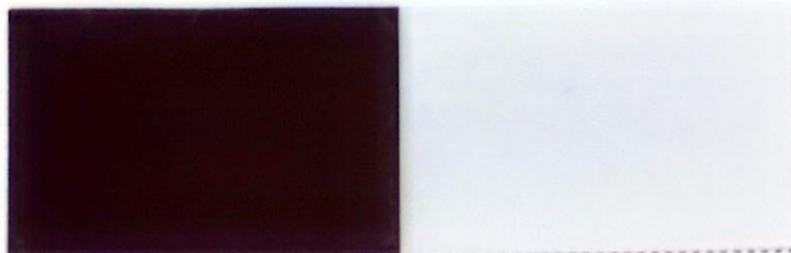
AG7215WRE 10-50 Pearl Red