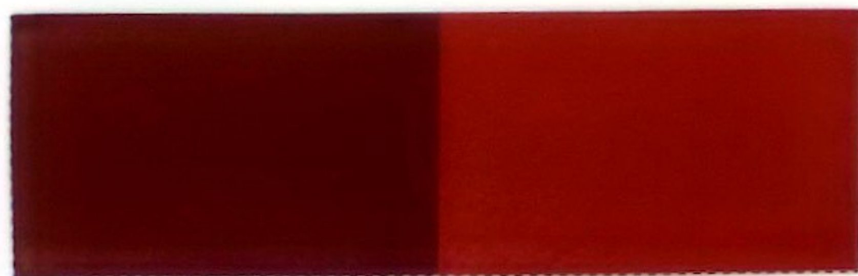
AG7504WRE 10-50 Wine Red