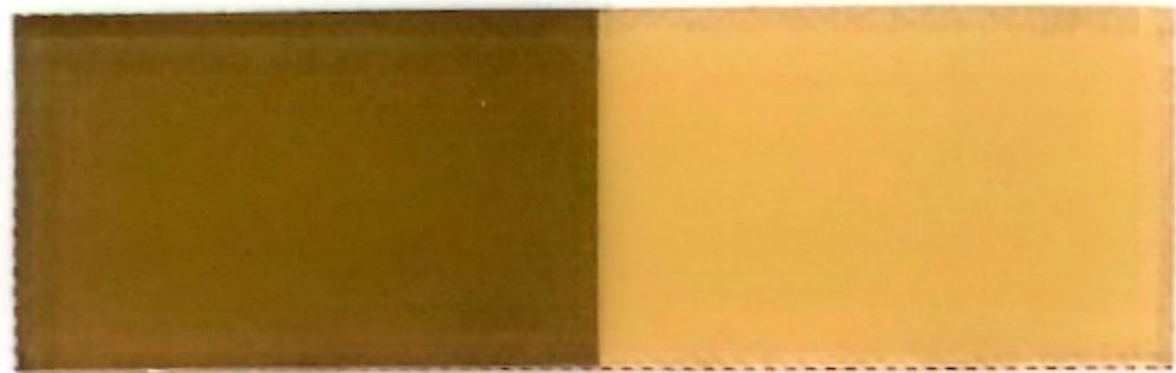
AG7308WRE 10-50 Classical Gold