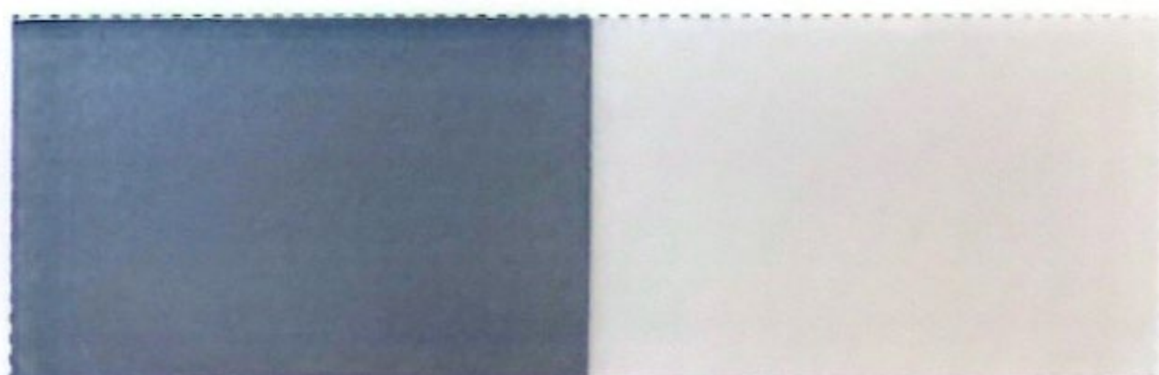
AG9123WR 5-25 Fine Satin