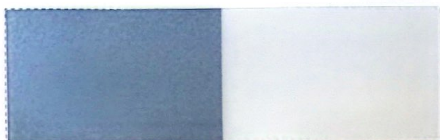
AG9104WR 10-40 Pearl Silk