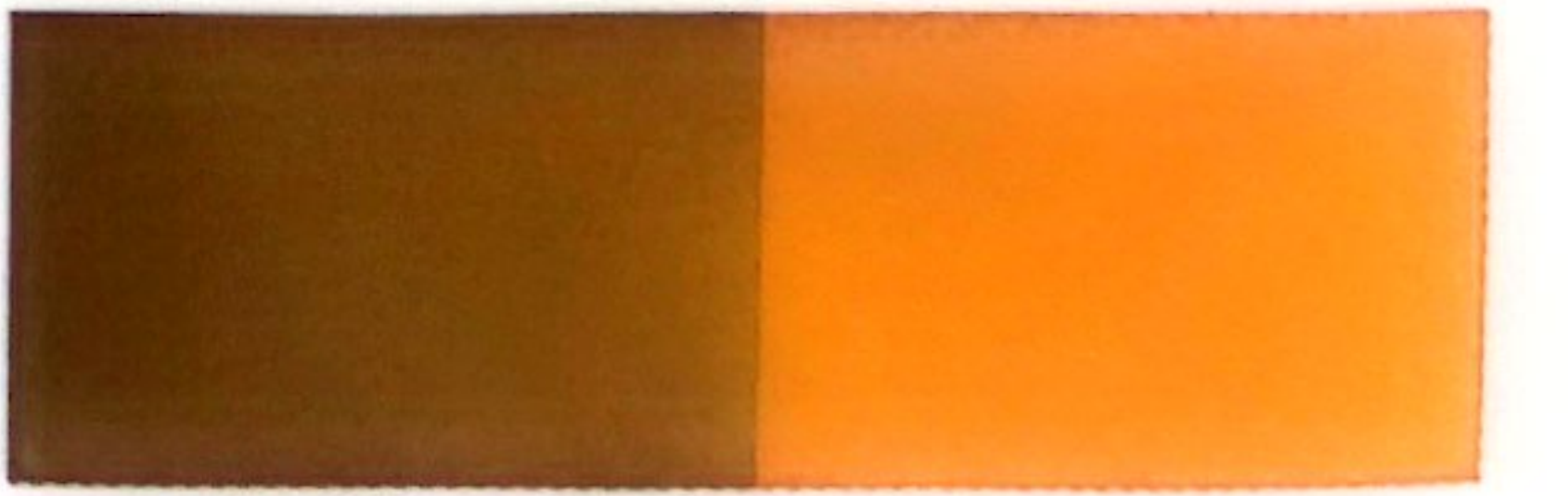
AG9323WR 5-25 Royal Gold Satin