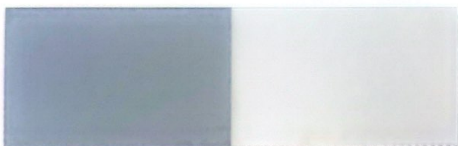
AG7111WRE 1-15 Fine Satin Pearl