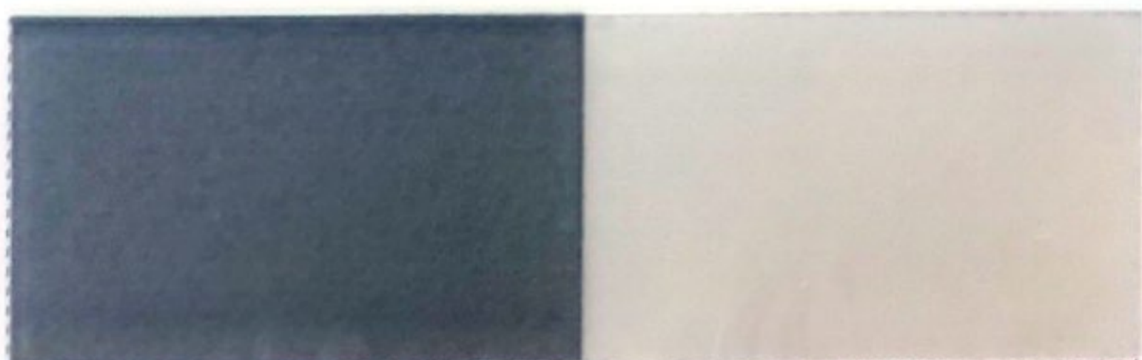
AG7103WRE 10-50 Pearl Silk