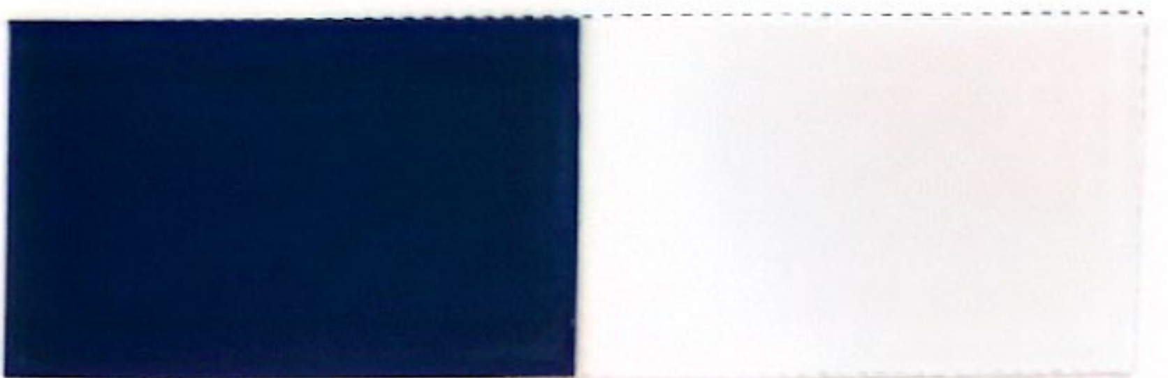
AG9225WR 10-40 Pearl Blue