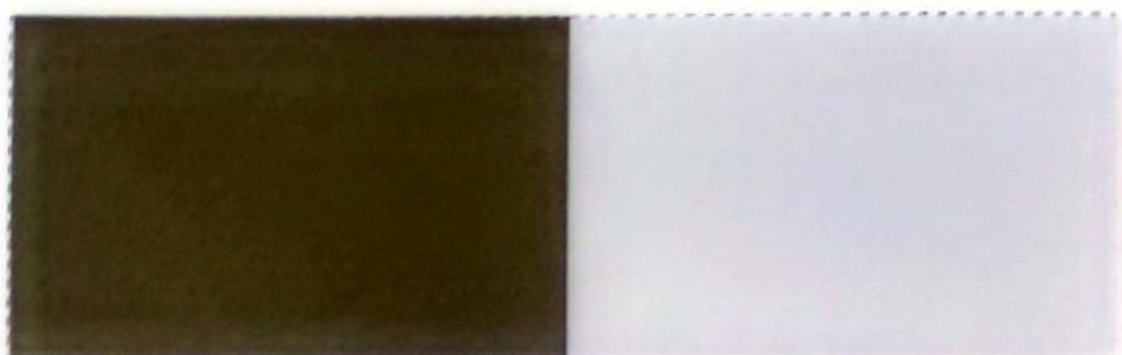
AG7205WRE 10-50 Pearl Gold