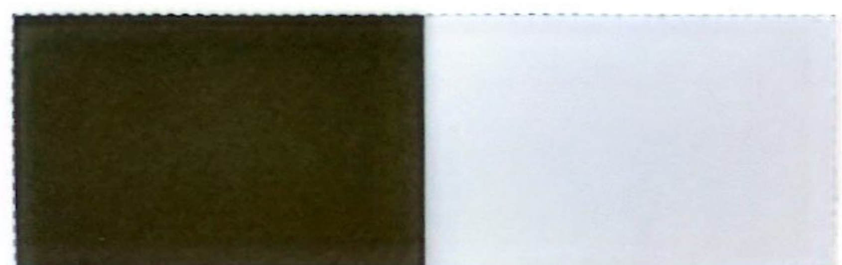
AG9205WR 10-40 Pearl Gold