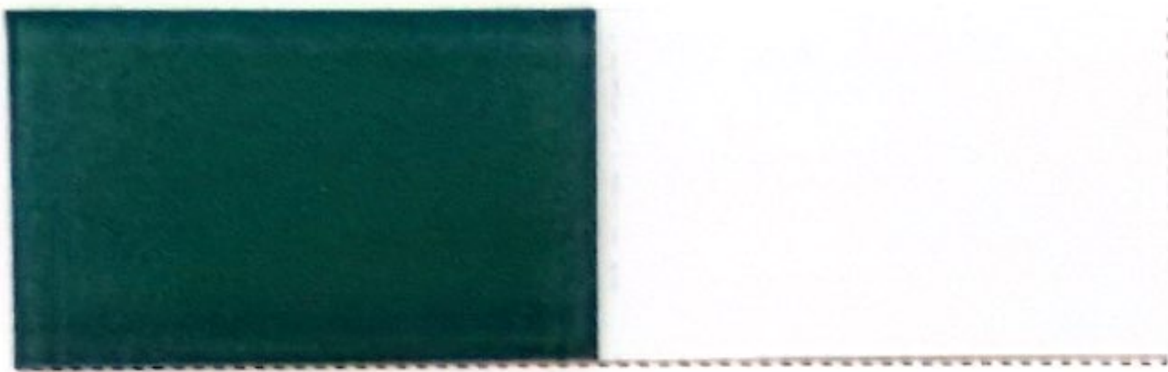
AG7235WRE 10-50 Pearl Green