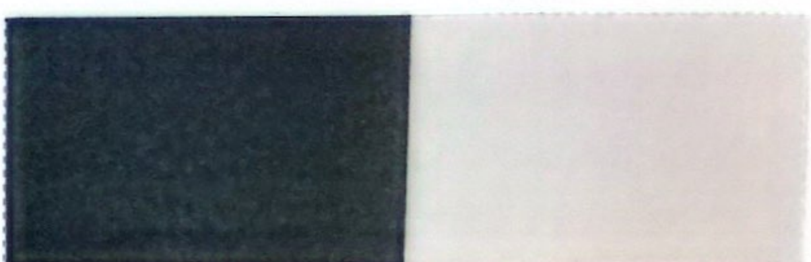
AG9151WR 20-80 Shiny Pearl