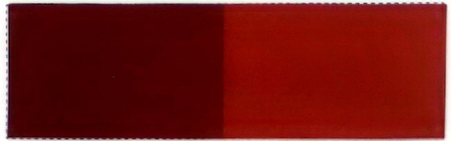
AG7524WRE 5-25 Red Satin