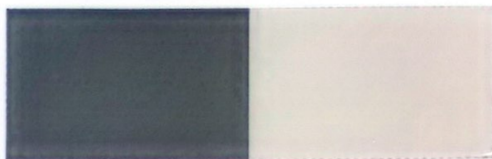
AG7123WRE 5-25 Fine Satin Silver