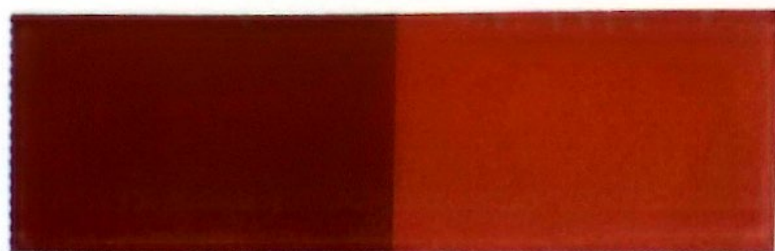
AG9502WR 10-40 Red-Brown