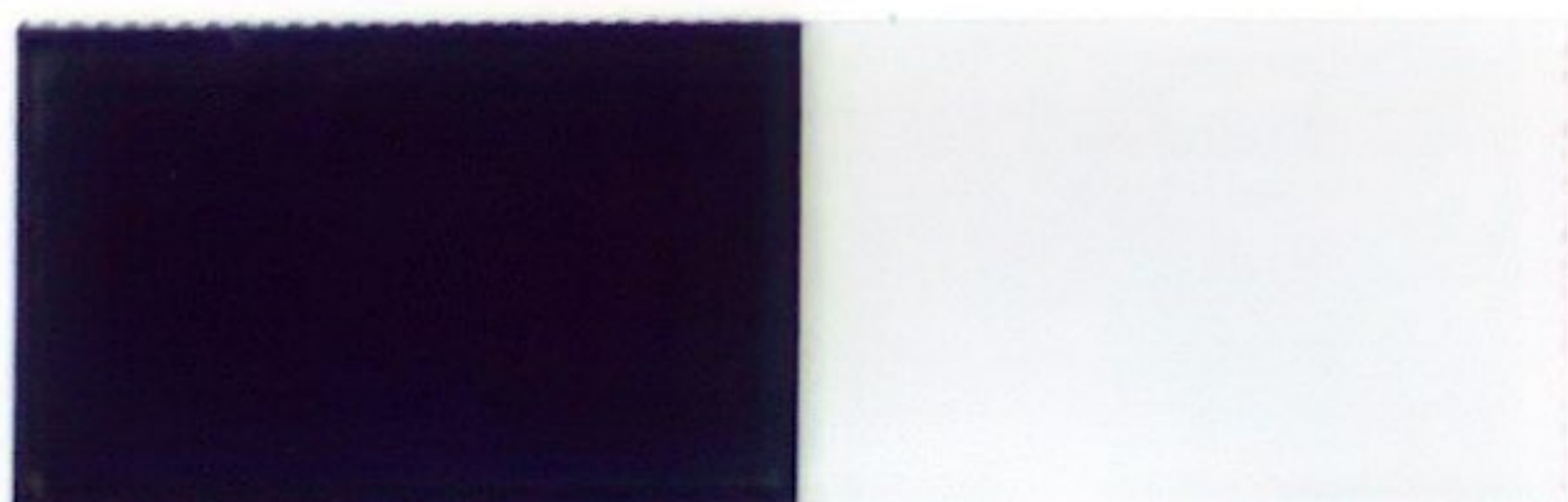
AG7219WRE 10-50 Pearl Violet