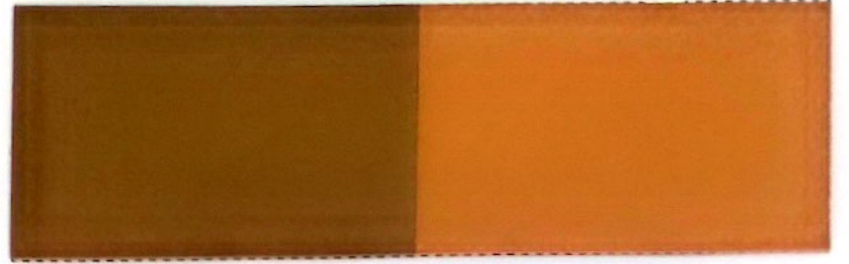
AG7323WRE 5-25 Royal Gold Satin