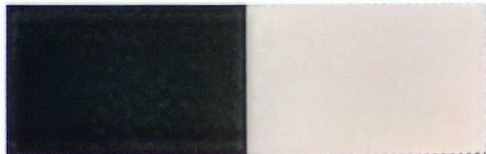
AG7151WRE 20-80 Shiny Pearl