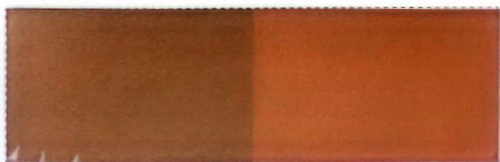
AG9500WR 10-40 Bronze