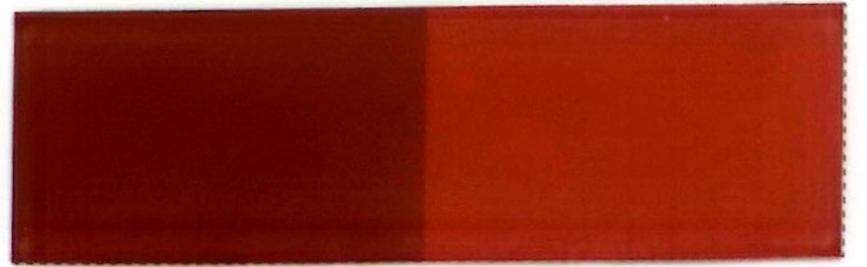
AG7502WRE 10-50 Red-Brown