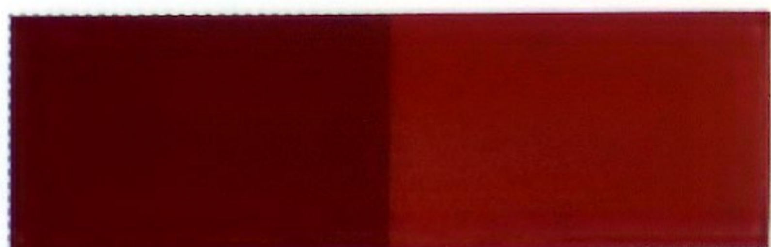
AG9524WR 5-25 Red Satin