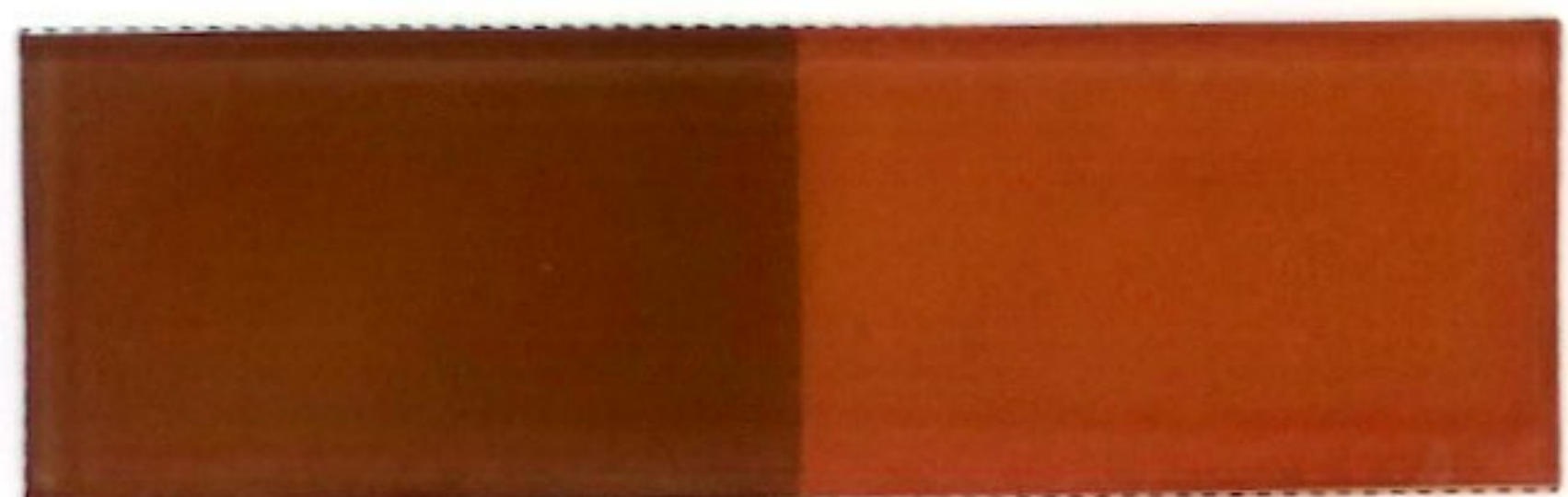
AG7500WRE 10-50 Bronze