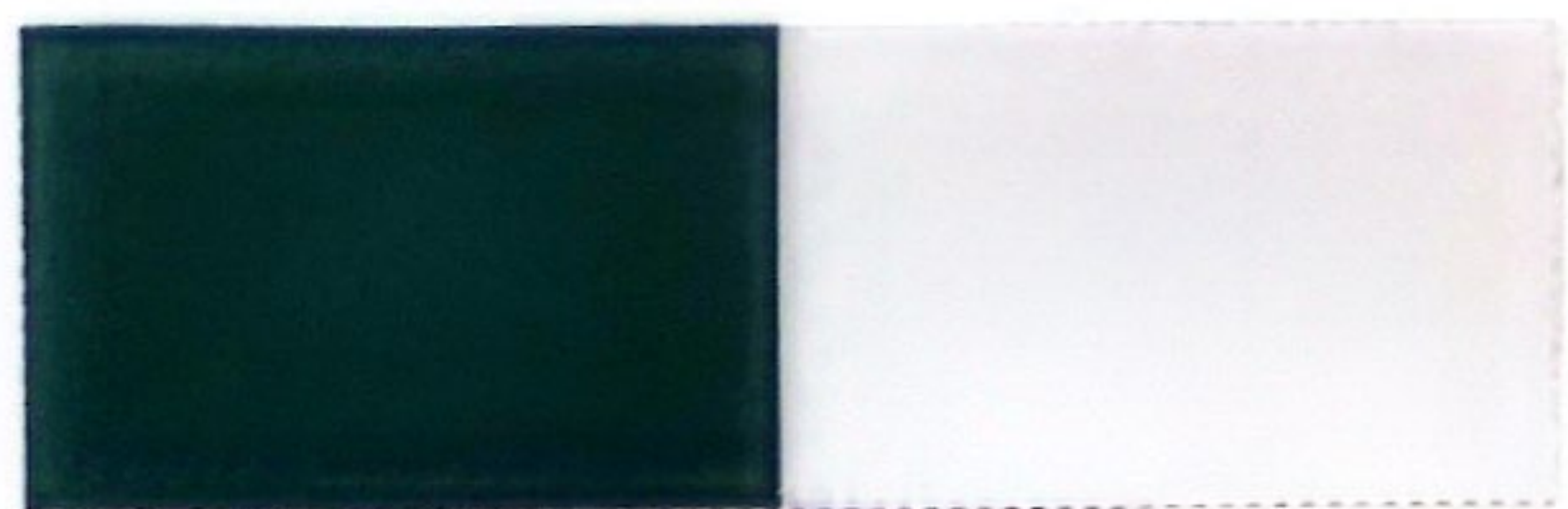
AG9235WR 10-40 Pearl Green