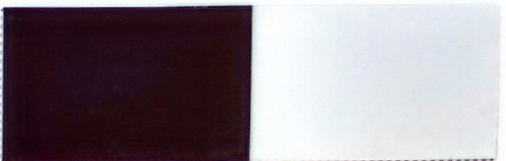
AG9215WR 10-40 Pearl Red