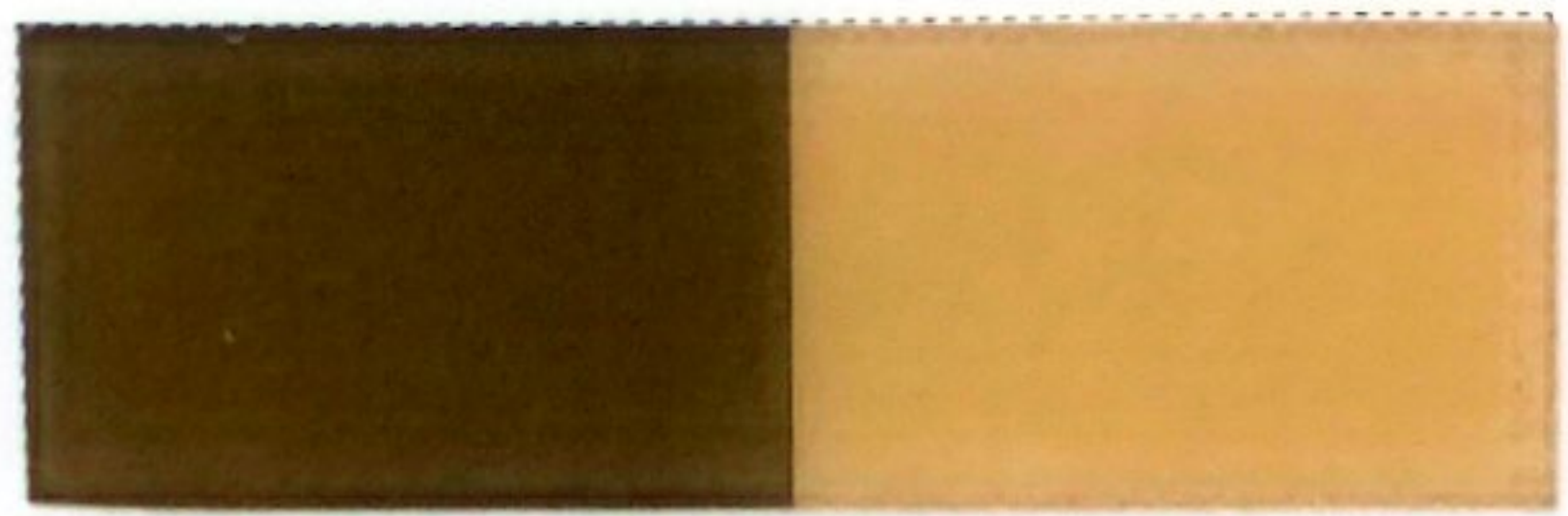
AG9308WR 10-40 Classical Gold