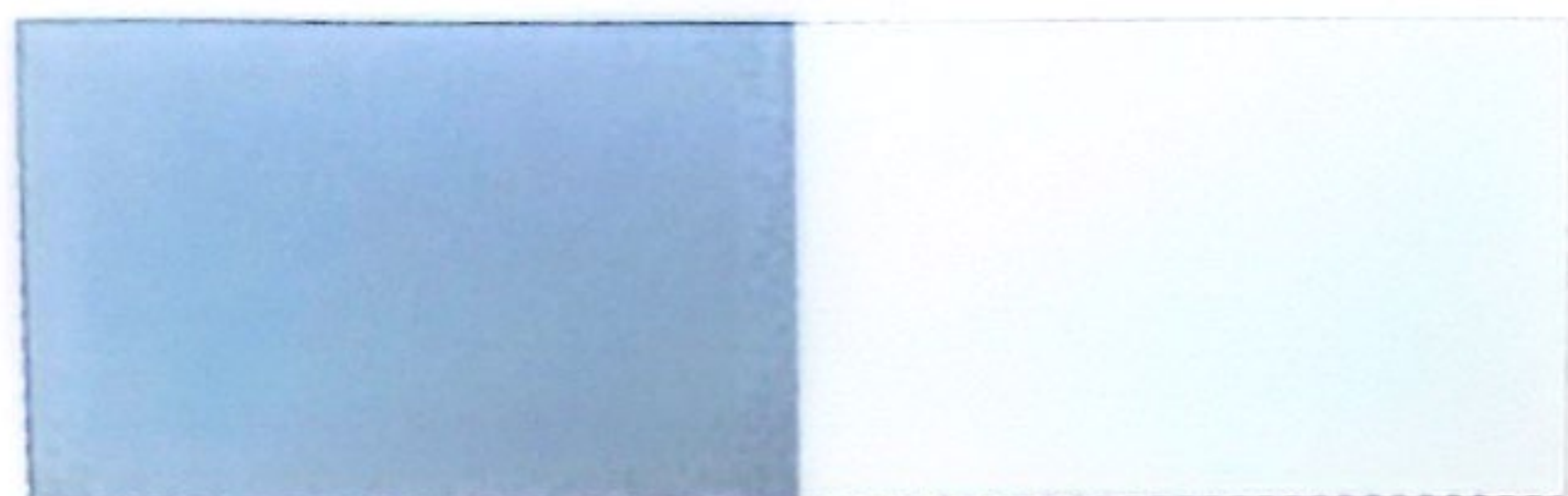
AG9111WR 1-15 Fine Satin