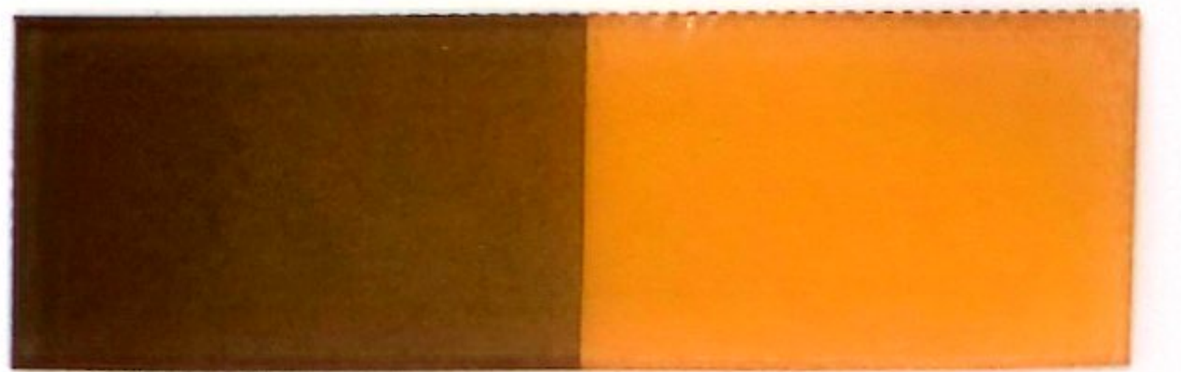
AG9303WR 10-40 Royal Gold