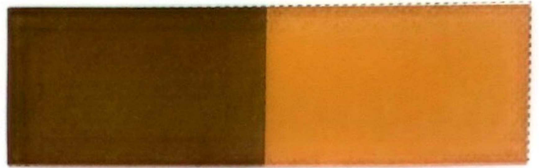
AG7303WRE 10-50 Royal Gold