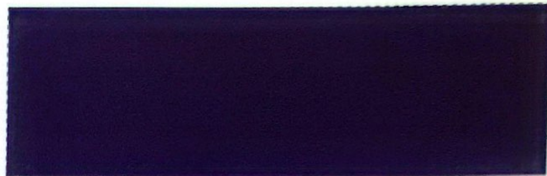
CM8282/CM8282WR 10-40 G-Y-P