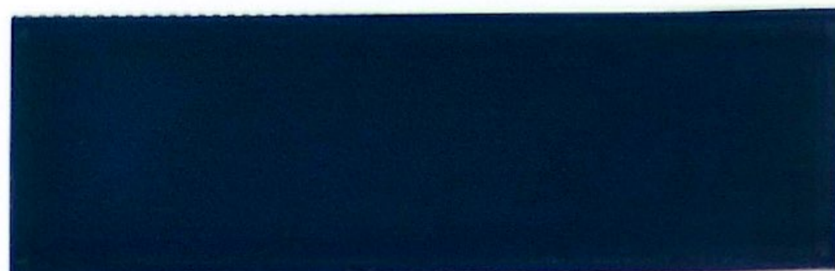
CM8284 / CM8284WR 10-40 R-P-BG