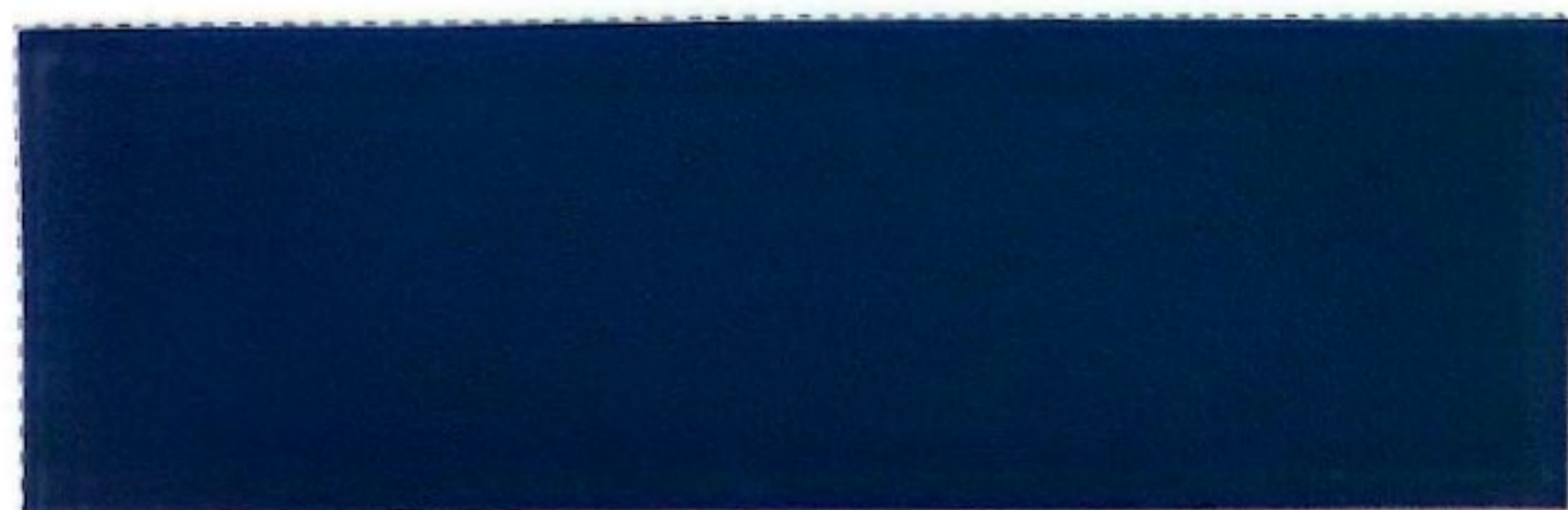
CM8283/CM8283WR 10-40 R-P-B