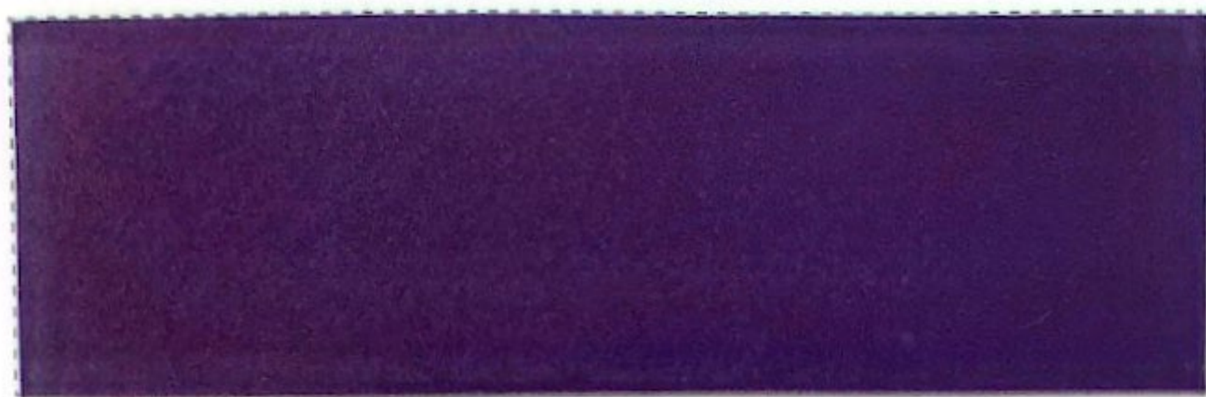
CM8281/CM8281WR 10-40 G-Y-R