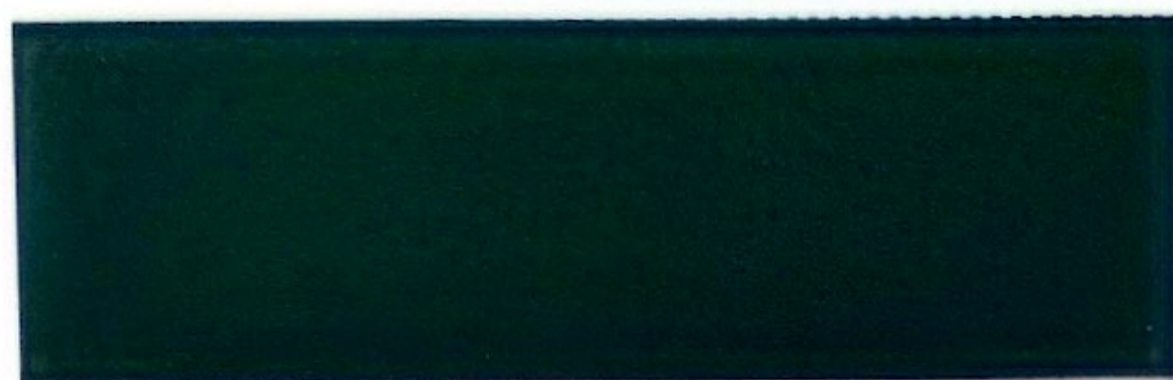
CM8285/CM8285WR 10-40 R-B-G