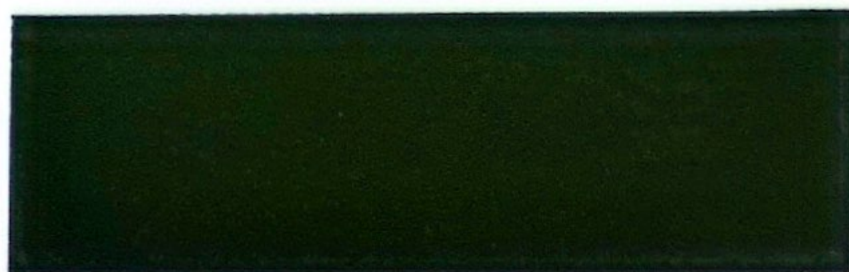
CM8286/CM8286WR 10-40 B-G-Y